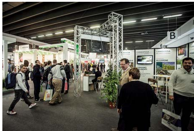
The 2015 edition

There will be buyers from extra-EU countries such as Saudi Arabia, Kuwait, Qatar, Bahrain and Dubai, as well as from Germany (one of the main European markets for pears) and Spain; representing some of the leading retail chains (Danube Company, Edeka Frucht Su and Gulfmart) and import-export companies (Francaise Food Co., Don Limon, Global Fruit Point, Savasan Fresh, Group Iberica, Banana Trading and Adel&Sadiq Trade Company).